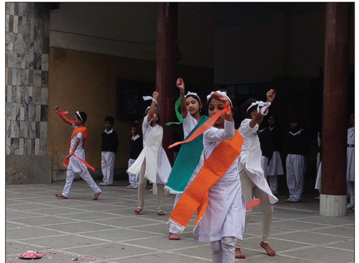
Students of Auxilium Parish School put up colourful & rhythmic dance performances on Republic Day 26 January.